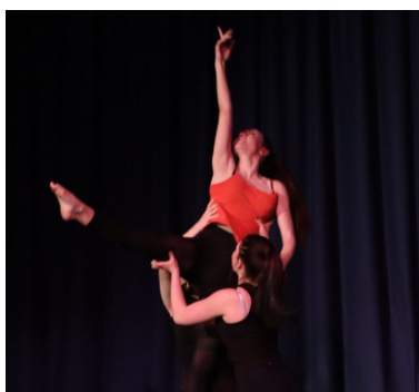
Over 40 students were involved in this year's annual Dance Showcase "Spring into Dance" with representatives from all year groups. Students were able to perform exam pieces as well as techniques and class work. We can't wait to get to do it again next year!