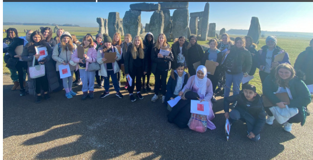
Year 7 students went on a residential trip to explore Stonehenge and the Eden Project. They did really well applying knowledge from lessons to the activities there. We even managed to squeeze in a quick visit to the beach!