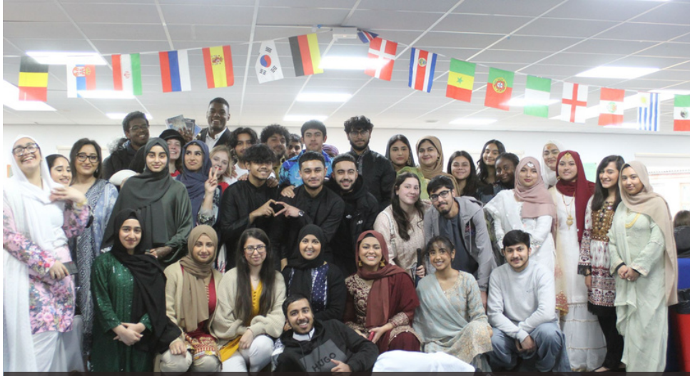
The Senior Prefect Team organised an enjoyable event and we were able to see our Sixth Form students dress up and embrace their cultures in such a wonderful way.