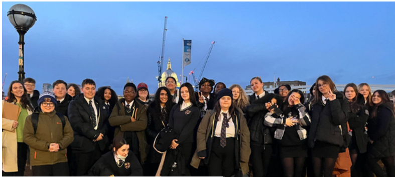
Students from years 9, 10 and 11 had a fantastic time travelling to Shakespeare's globe in London to see a wonderful production of The Tempest