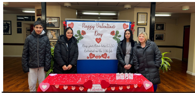
WorkSkills students organised a Valentine roses business who managed to deliver 190 roses on the last day of term!