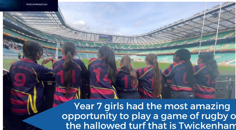
Year 7 girls had the most amazing opportunity to play a game of rugby on the hallowed turf that is Twickenham Stadium.