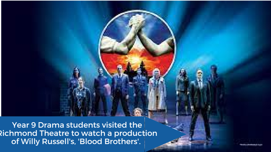
Year 9 Drama students visited the Richmond Theatre to watch a production of Willy Russell's, 'Blood Brothers'.