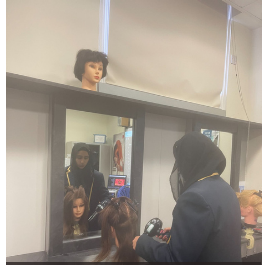
Year 11 students were excited to be invited to spend a day at Brooks Hair & Beauty where they were able to practice various hair, nail and massage techniques in the training salon.